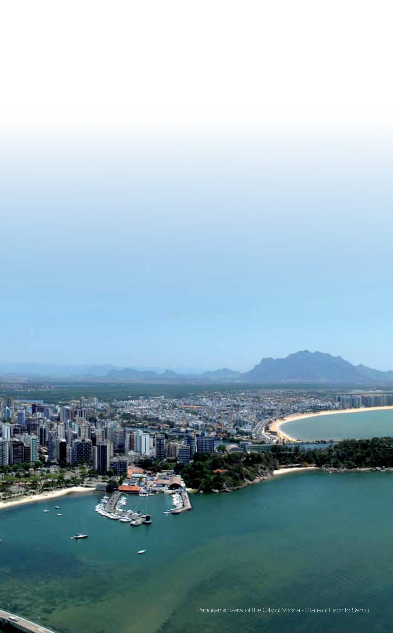
Panoramic view of the City of Vitória - State of Espírito Santo