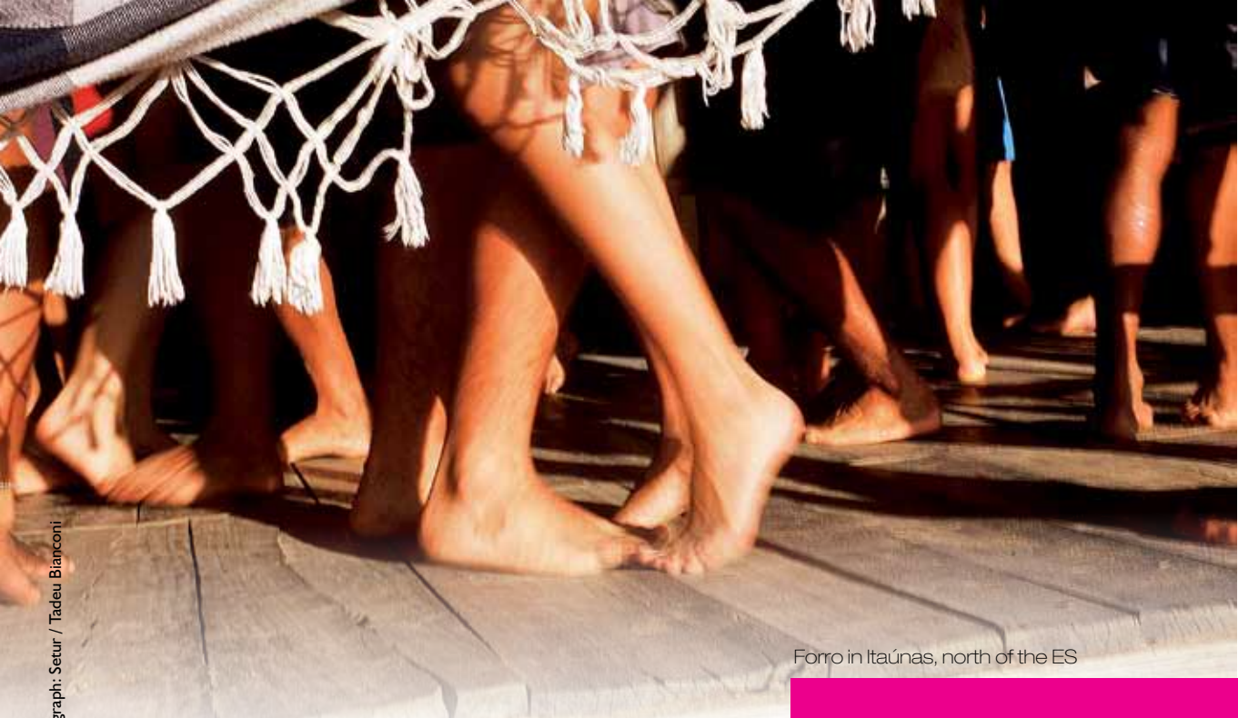
Fôrro in Itaúnas, north of the ES