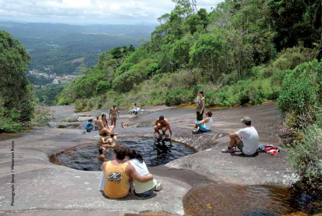
Natural pools, in the Pedra Azul State Park

out because of its climate and the large variety of orchids. Many festivals are held here, such as the Italian-German Festival.