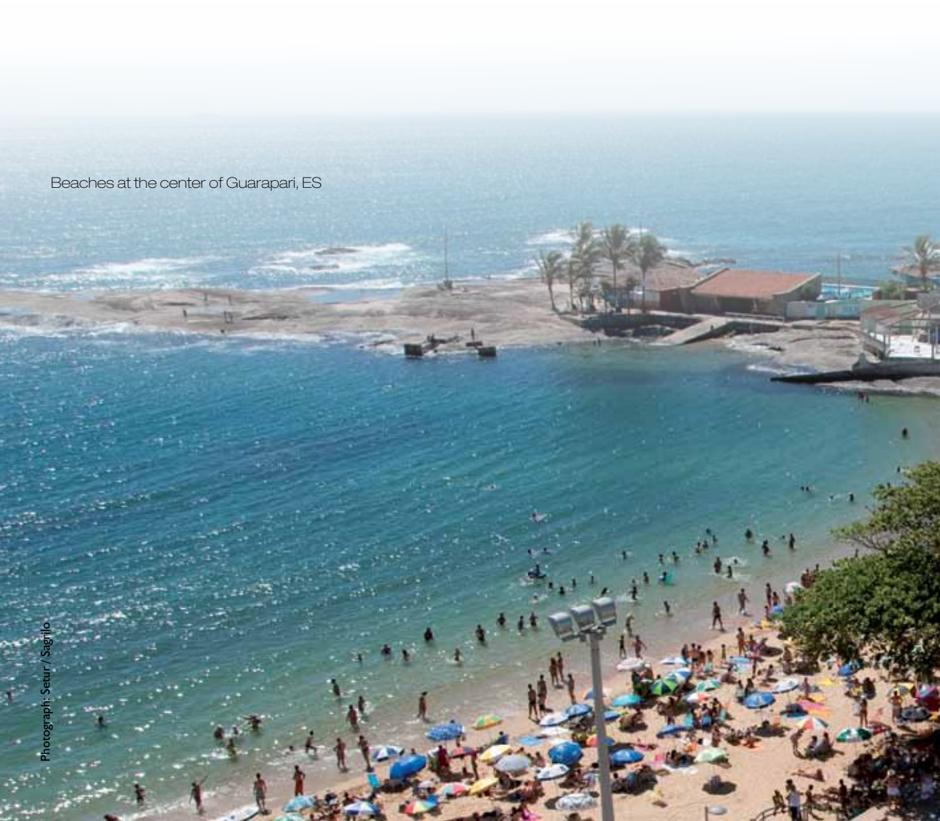
Beaches at the center of Guarapari, ES