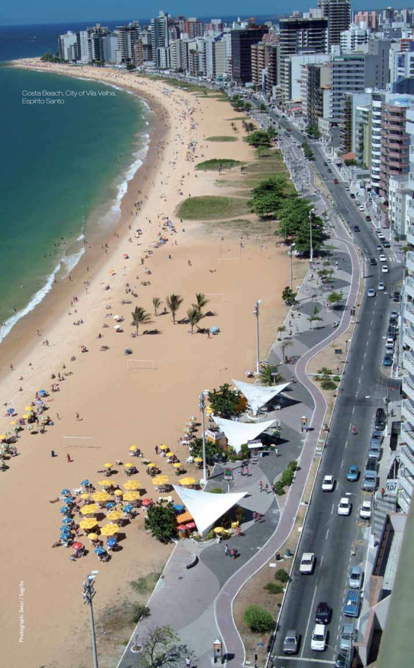
Costa Beach, City of Vila Velha, Espírito Santo