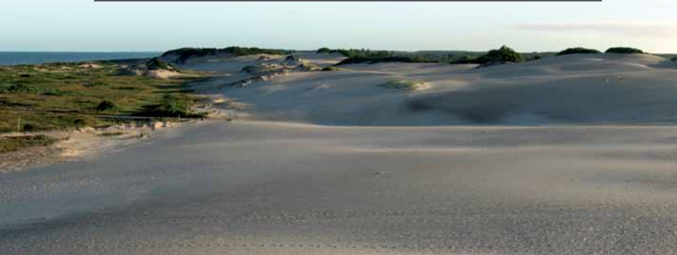
Dunes of Itaúnas